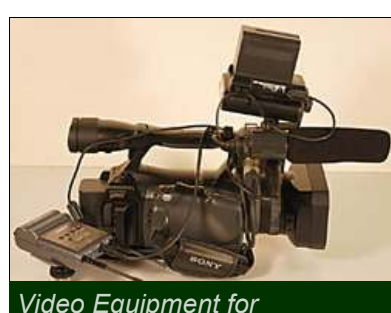
Video Equipment for Moviemaking

http://avbarn. museum.state.il.us/ education/ oralhistoryhowto/ technology